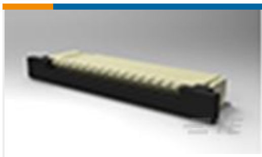
TE Part # 84953-9 1MM FPC HORZ.TOP CONT.ASSY 9P